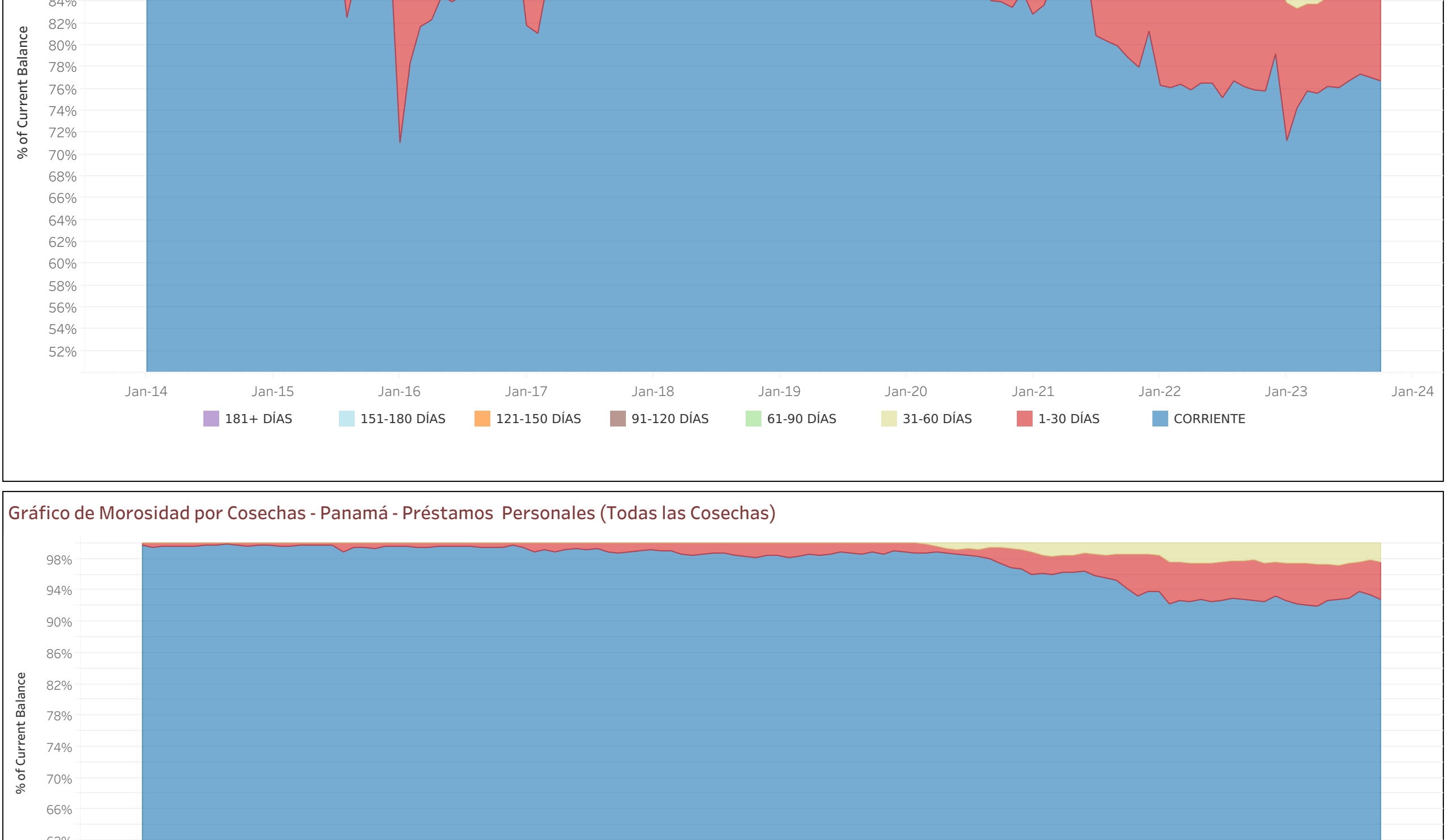
Gráfico de Morosidad por Cosechas - Panamá - Préstamos Personales (Todas las Cosechas)